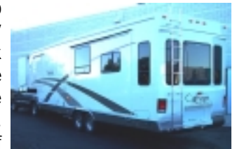
Chevy 2500 HD Duramax, 2003 Carriage 36' Carri-Lite

We started with a 2002 Chevy Duramax 2500 HD with Quad-Cab and long bed pulling a 2002 36' Carriage Carri-Lite. Both the truck and the trailer were brand new. The truck was equipped with a Reese 20K fifth wheel with 4-way head. We began our testing on some of the roughest roads in the Detroit metro area as you can see from the