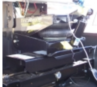
Sachs shock with string pot collector

actual components of the trailer, like the fiberglass skin or the frame might receive. By comparing and contrasting the same truck and trailer, traveling on the same portion of road at identical speeds, with and without the Trailair product, we can then get an indication of the reductions in those forces, what the improvements in dampening are, and also how the tow vehicle might handle better.