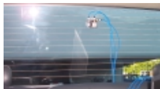
Accelerometers on rear window