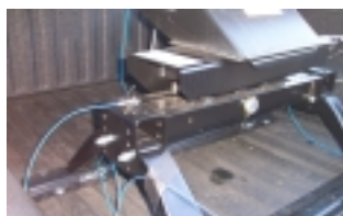
Accelerometers on 5th wheel